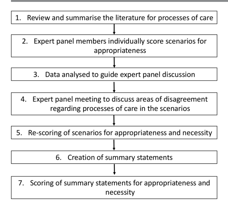
Figure 1 The RAM process.

were then sent to the advisors of the group for comments and feedback.